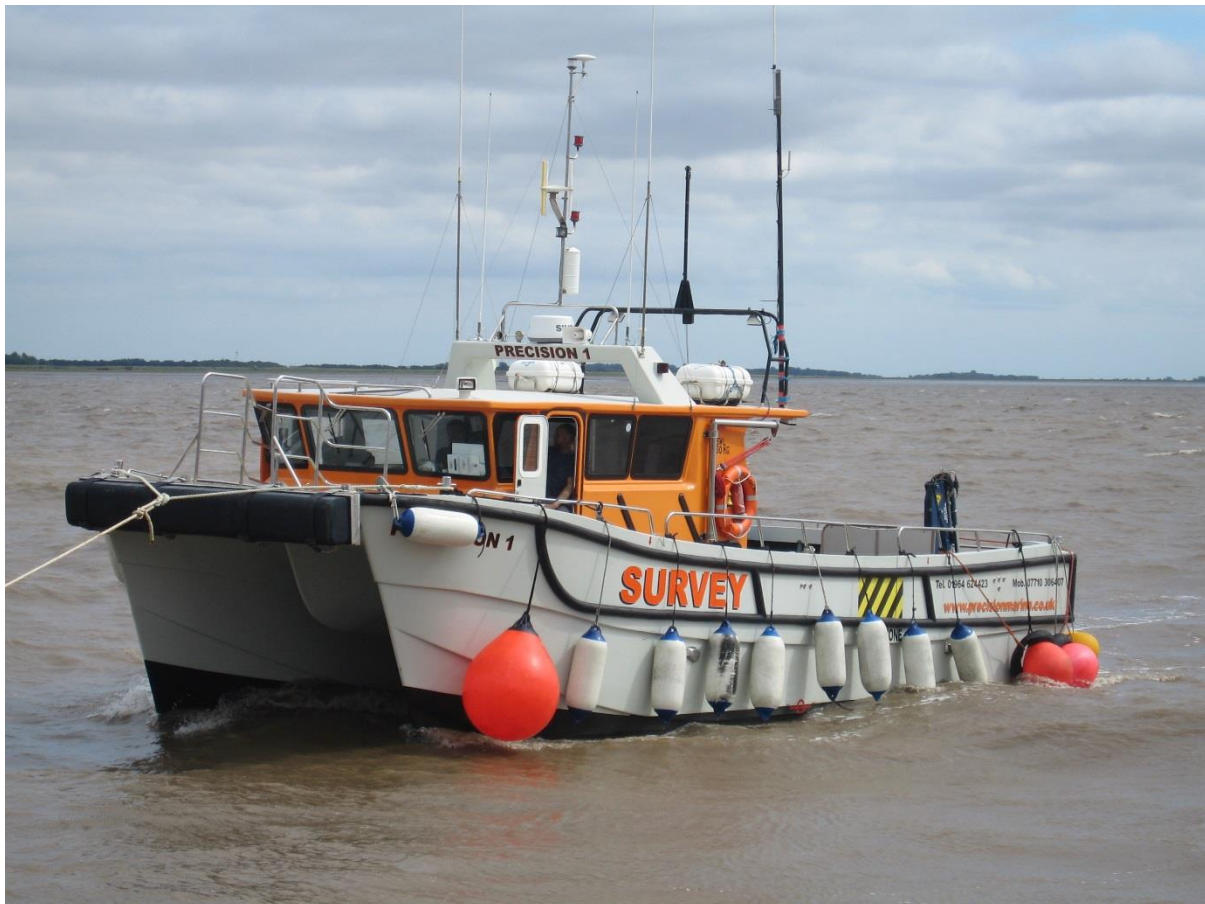
Figure 2 – Survey Catamaran ‘Precision 1’